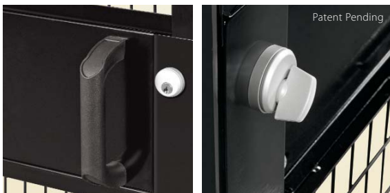
Standard doors include pull handle, built-in cylinder lock and thumbturn.