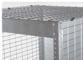
Wire mesh top and sheet metal back option