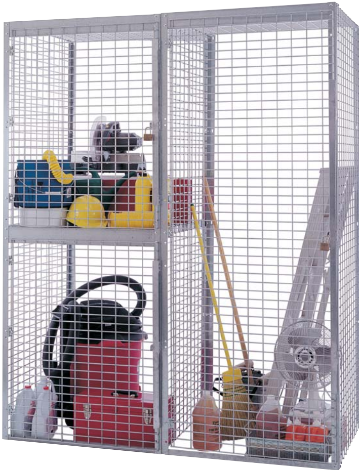
Double Tier Starter Unit with Single Tier Add-on Unit shown.

All-galvanized steel Stor-More® Tenant Storage Lockers provide sturdy, secure storage for tenants and businesses.