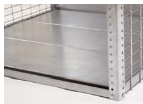
Sheet metal bottom shelf option