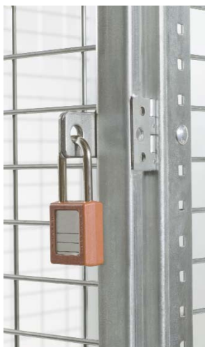
Full height hinged anti-pry locking bar