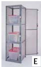
Variety of locker back options available, including rear doors for filing stock and inventory control.